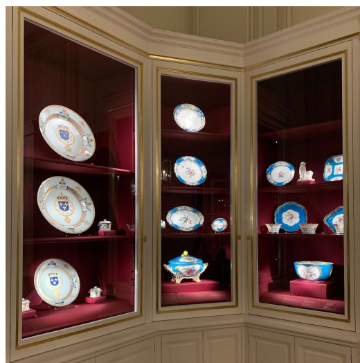
View of the Porcelain Room at the Palace of Versailles