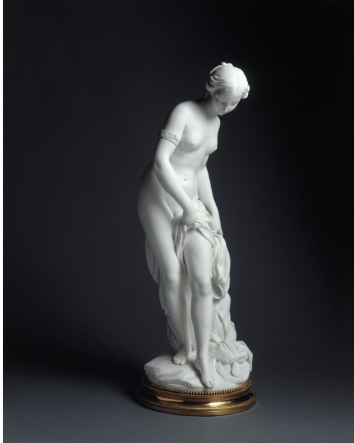
La Baigneuse , after Falconet, c.1758–66 The Metropolitan Museum of Art, New York. Inv. no. 50.211.138a