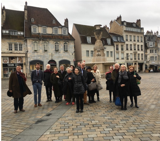
FPS members opposite the Musée des beaux-arts et d'archéologie de Besançon