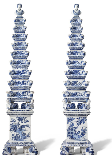
Delftware pyramids, 17th century

Kunstmuseum Den Haag, NL, 1 June - 22 November 2020